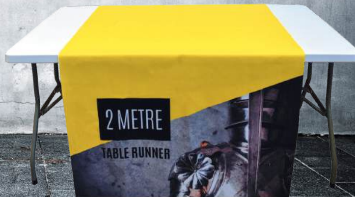
Table not included