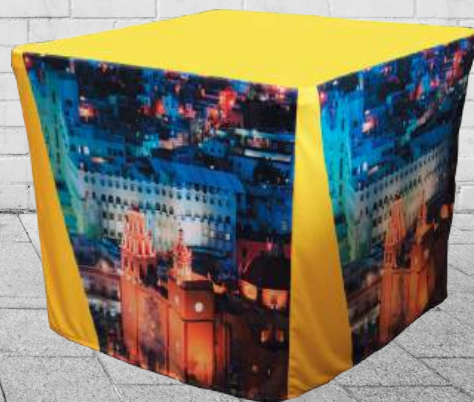
Table folds flat