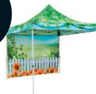
Full height wall