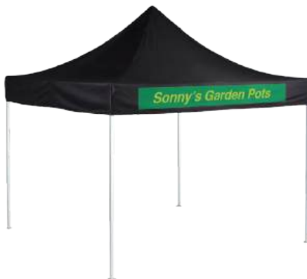
Frame + black canopy + printed fascia