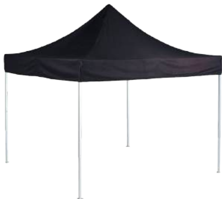
Frame + black canopy