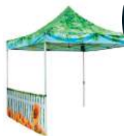
Half height wall