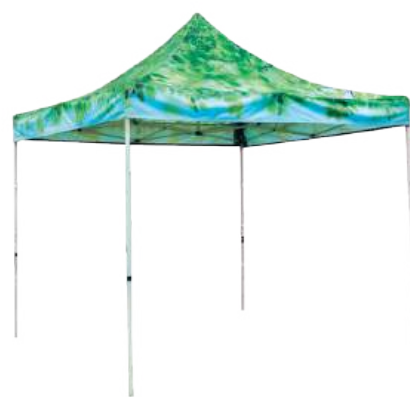
Frame + printed canopy